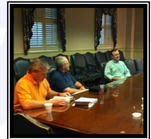
CLC Men's Group at FPC Marietta

I invite you to ask yourself where you stand with these statements. Are you allowing the tensions that arise when serving the Lord keep you from moving forward? Or do you simply adjust your position to go around them? Seek out the ways that the Lord is trying to use these tensions as a tool for growth in your life.