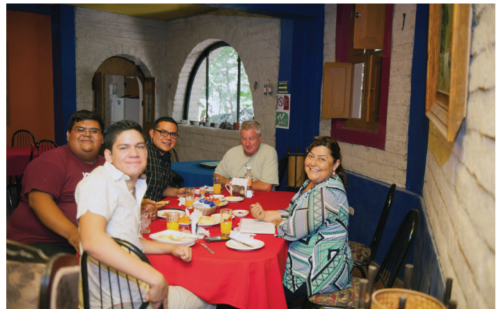
Team meeting with Casa Samuel at the Los Vientos hotel.